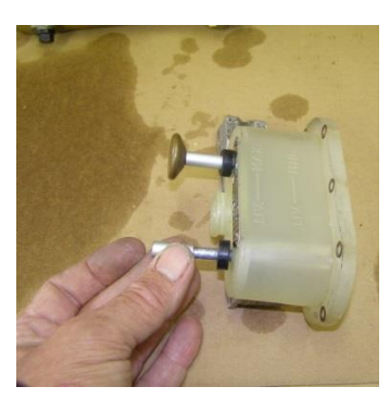
20. Mounting the dummy plungers. The copper disk presses the tube against the rubber seals