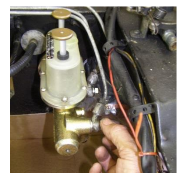
24. Fit the banjos but do not tighten yet. Fill some brake fluid in the reservoir and let it leak through. This facilitates later bleeding of the system. Use a suitable container to catch the spills. Then tighten up.