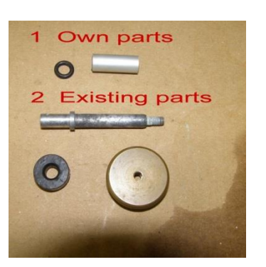
19. Modifying the old plungers for original looks. Aluminum pipe outer diam 8mm, length approx. 21 mm. Standard R03 O- ring