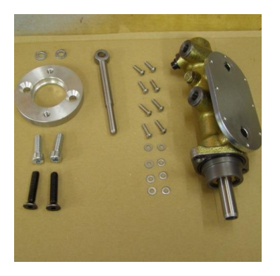
1. The contents of the kit.