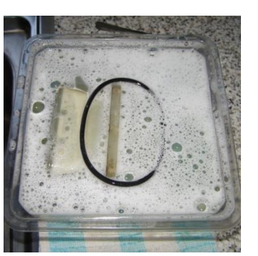
18. remove plungers and rinse container and sealing ring in warm soap solution