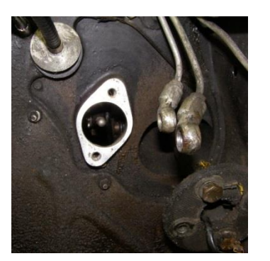
10. Clean up!