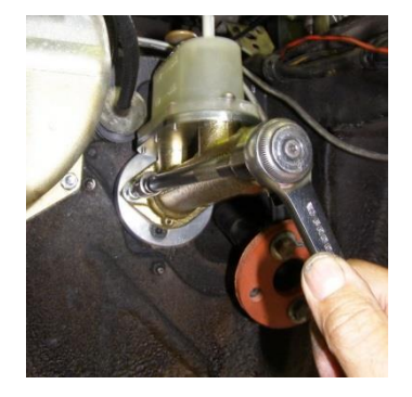
23. Mount the new cylinder with the bolts provided