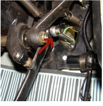
22. Important. Replace the pushrod at the brake pedal, it is longer than the original one!