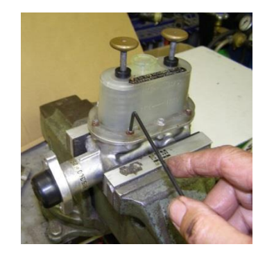
14. Remove brake fluid container from old cilinder