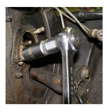
9. Remove the original studs with a suitable tool