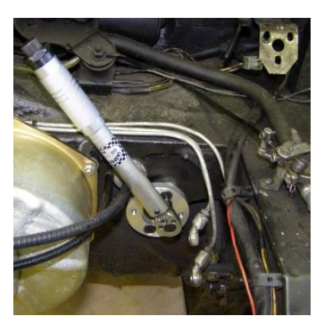
13. Torquing to 25 Nm should do (6mm bolt diameter)