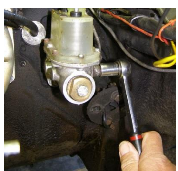
4. Removing the banjo bolts.