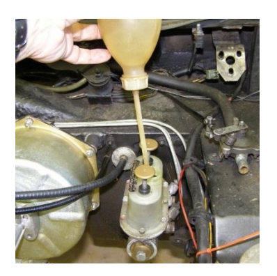
3. Draining the brake fluid.