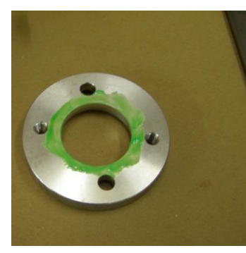
11. Thin coating of liquid gasket on the spacer.