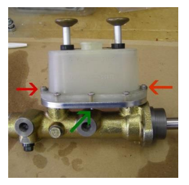
21. Reservoir mounted. Note extra washers at outer ends of reservoir as these screws cannot protrude through the bottom plate