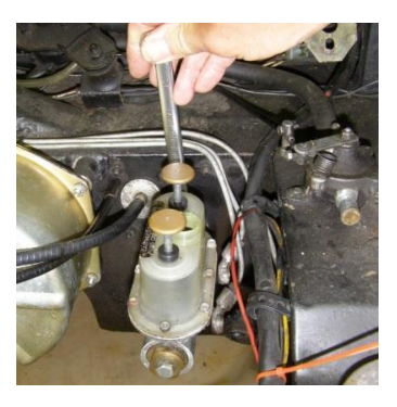
5. Remove the upper mounting nut