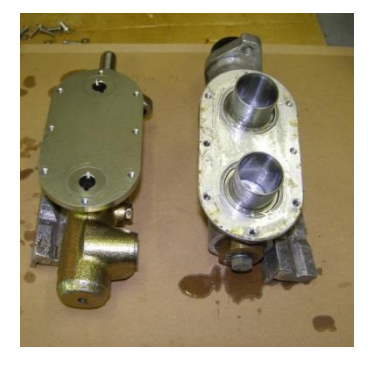
16 New and old cilinder