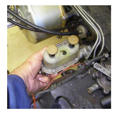
7. pull out the old brake cylinder.