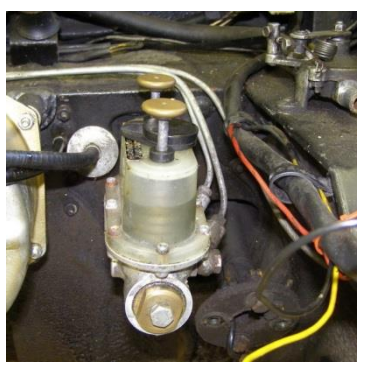
2. The old master brake cylinder.