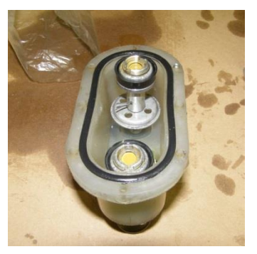
17. The brake fluid reservoir removed