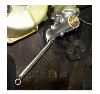
6. Remove the lower mounting nut